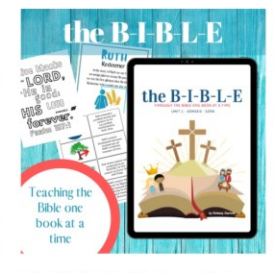
The BIBLE Unit 1: Genesis to Ezra (13 Week Curriculum) from $97 $125