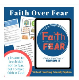
"Faith Over Fear" 5 Lesson Unit for Back-To-School from Hebrews 11 $55