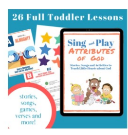
The Ultimate Toddler Bundle: Everything you need to teach age 1-3 about God