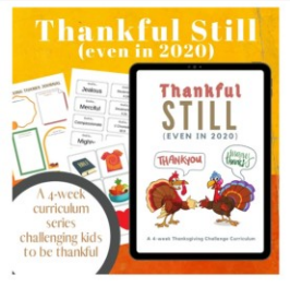
Thankful Still (even in 2020) 4-Week Sunday School Curriculum

If your church buys resources, please consider using <u>The Sunday School Store</u>. Church budgets are tight. That's why our digital curriculum is half the cost of printed material. Even when finances are limited, your teaching can make an eternal difference.