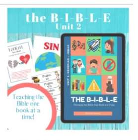
The BIBLE Unit 2: Nehemiah to Micah (13 Week Curriculum) from $97 $125