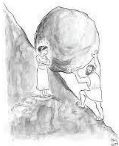
"I am not having this conversation again."