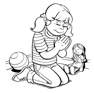
"Help me to forgive others as you have forgiven me."